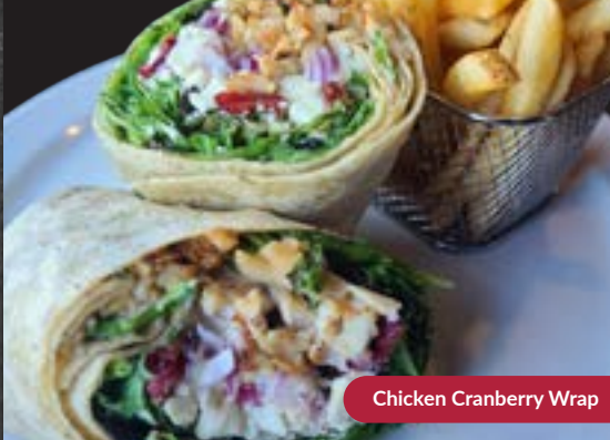
Chicken Cranberry Wrap