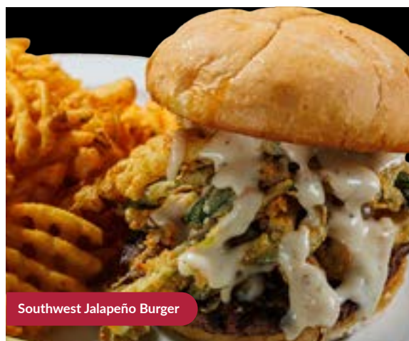
Southwest Jalapeño Burger