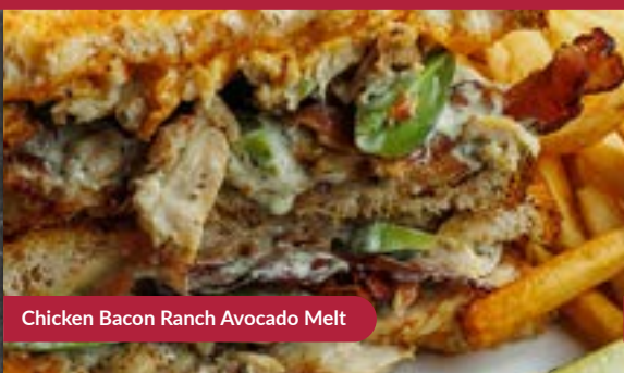
Chicken Bacon Ranch Avocado Melt

All wraps and handhelds are served with choice of French fries, tater tots, homemade chips, criss cuts, coleslaw, or potato salad. Substitute sweet potato fries for $1 or onion rings for $2.